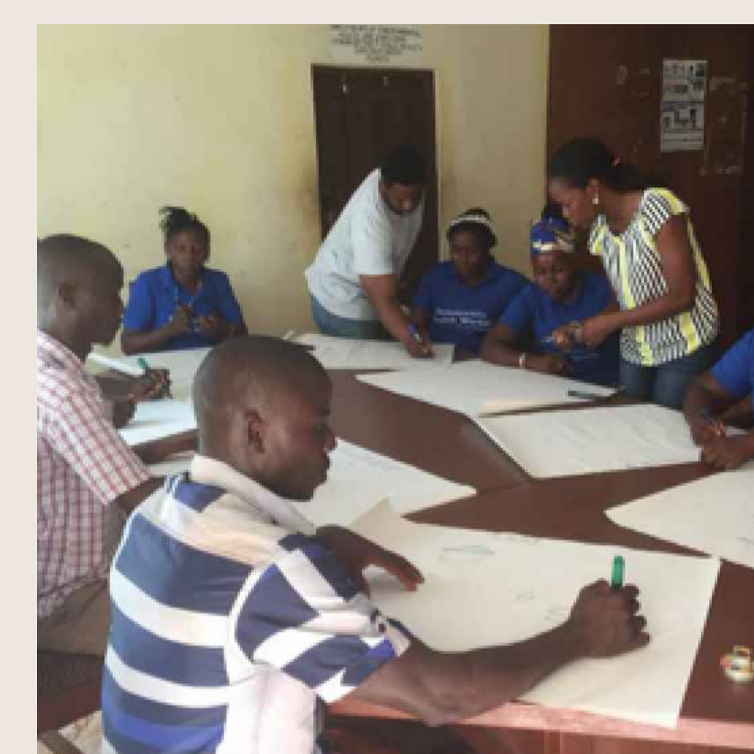
Figure 1: CHWs draw maps to show how they work in their communities

We developed 3 case studies: Sierra Leone, Liberia and Democratic Republic of Congo. Using multiple methods (document review, in depth interviews with supervisors and decision makers, life histories with CHWs, photovoice and community mapping – see figures 1-4) we have explored how CHWs are supported and managed, how they interact with their communities and health systems, the challenges that they face and how they solve these. Data were analysed using the framework approach and synthesised across the three contexts.