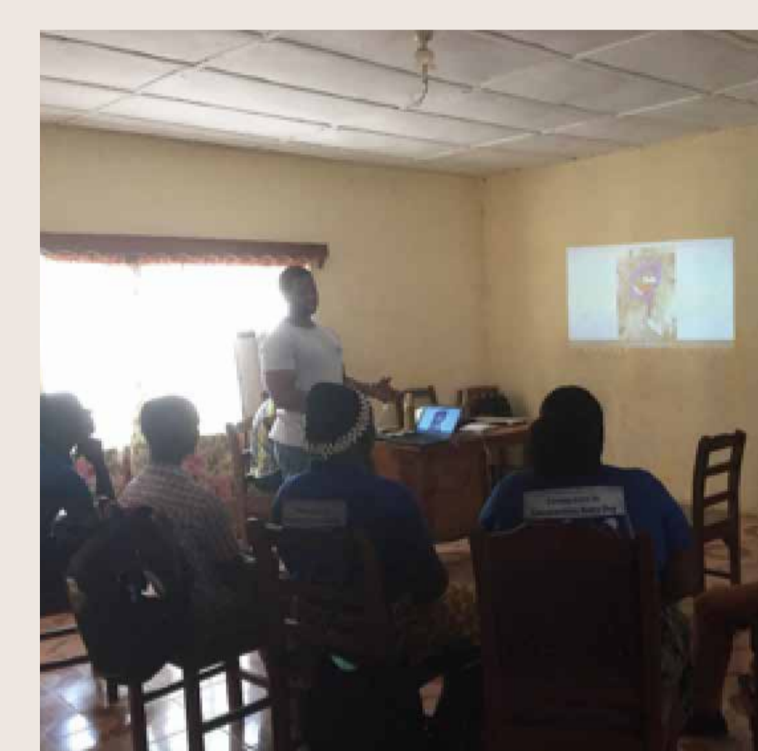
Figure 4: CHWs discussing photographs that they had taken in their community