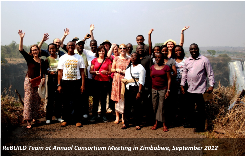
ReBUILD Team at Annual Consortium Meeting in Zimbabwe, September 2012

Biomedical Research and Training Institute, Harare, Zimbabwe