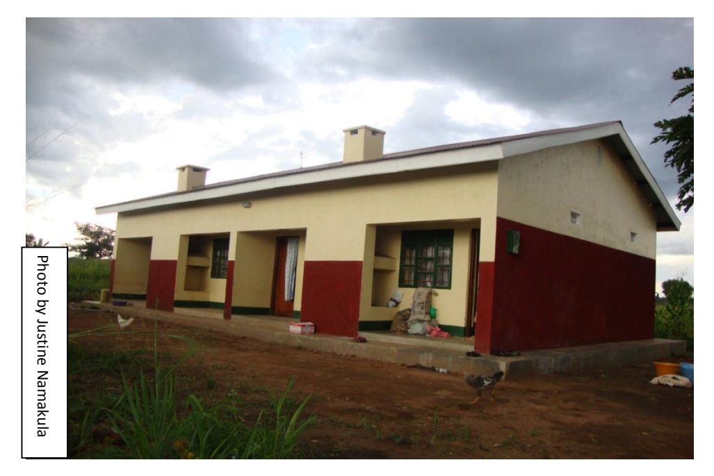
Figure 2: New staff housing at one of the health facilities constructed under PRDP in Pader district

The key informants pointed out that even after the PRDP intervention, the accommodation situation has not yet improved to a desired level. There are too few housing facilities for the numbers of health workers and the houses are small in relation to the health workers' family sizes. Unlike the PNFP sector, in the public sector there were no efforts to financially support the staff who were unable to be accommodated. Hence, accommodation is still a problem that could result in staff arriving late to work, absenteeism as well as affecting service delivery in the long run. In these circumstances questions arise about the criteria used to select those for staff accommodation. This causes demotivation and friction among health workers.